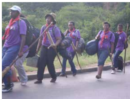
Don't give up you've been to Lexden, you're a stout fella...participants during their hike.

It is always a challenge to ensure that as the Course Director the standards are met and that each participant leaves having gained valuable experience about being a good, capable leader. It’s important that these participants add value to their groups when they get back and impart the leadership knowledge and skills they have learnt at PLTU”, he said.